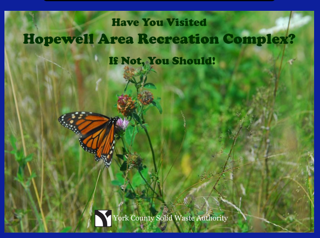
Have You Ever Visited the Hopewell Area Recreation Complex (HARC)?

HARC is especially beautiful this time of year. This closed landfill has been transformed into a recreation complex that includes playgrounds, ball fields, walking trails and picnic areas. We have wildlife viewing platforms for visitors to spot the many species of birds that inhabit the area. Do yourself a favor and take advantage of all that the HARC has to offer.