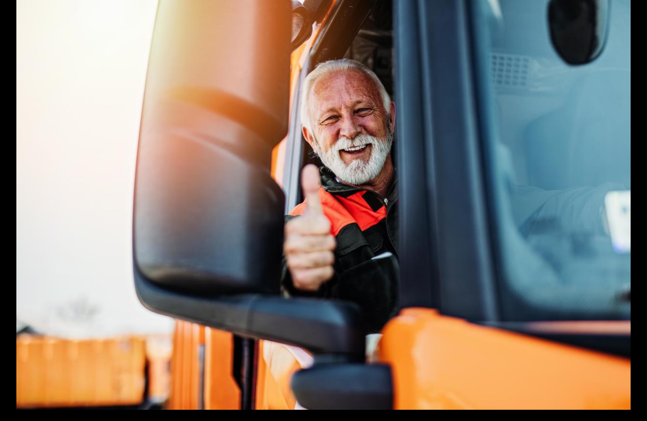
New Hauling Companies Bidding in York County

Through our tracking of York County municipal waste and recycling contracts, YCSWA has recently become aware of new hauling companies bidding in York County. For a full list of companies YCSWA is aware of that may bid on York County municipal contracts, please follow the link below to our website page of resources for municipalities. This page also contains a link to our YCSWA Waste and Recycling Bid, Contract, and Services Guide which details best practices for bid specification and contract documents.