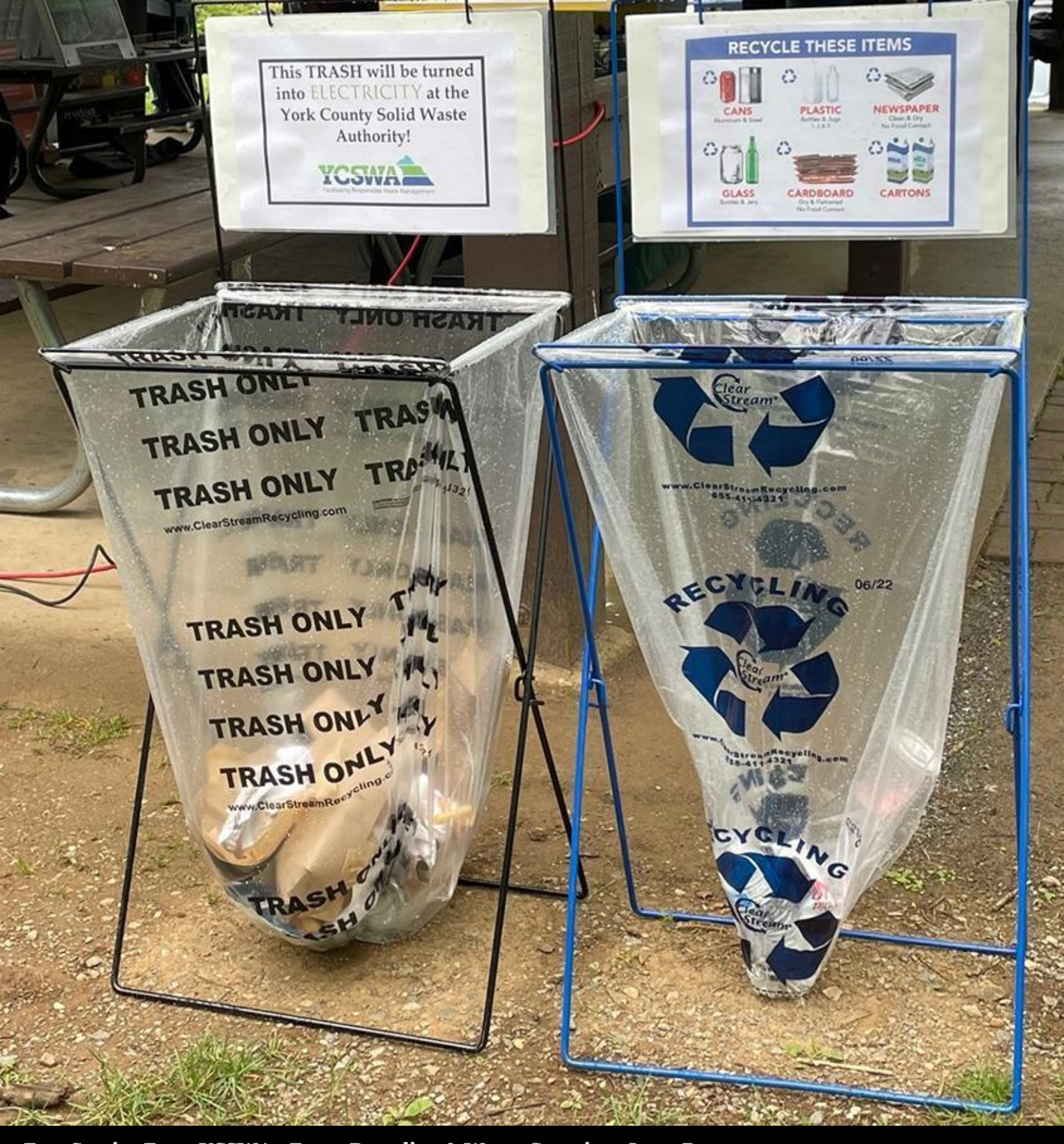
Free Service From YCSWA: Event Recycling & Waste Container Loan Program

Single-use beverage and food containers and other items used at events create an important need for organized recycling and waste practices. Local waste and recycling haulers can provide large dumpster-style containers and transporting services, but are often unable to supply regular recycling and waste bins to be stationed throughout the event area. Often, event organizers are forced to use their own personal bins or purchase new ones to be used at the event. Transporting and reclaiming personal bins can be a hassle and storing extra bins that are only used once or twice a year isn't ideal either.