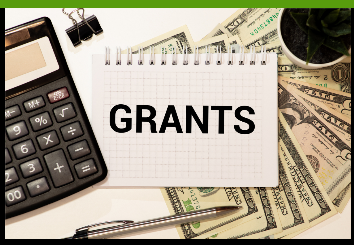
DEP 904 Recycling Grant Coming Soon!

Serving our community by providing recycling education and resources.